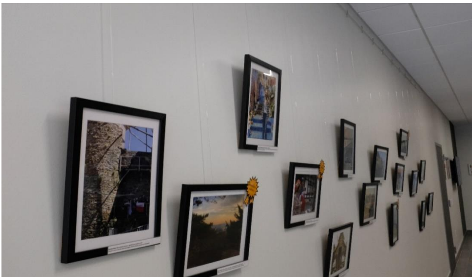
Example of Fall 2020 Bearkats Abroad Photography Contest Exhibit

Location: Second floor, on the east wing past the bookstore, the Art Display is available for use on a first come, first serve basis.